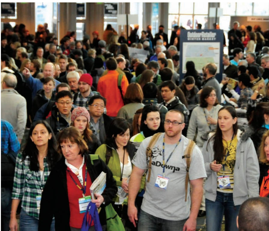
Visitor figures at Outdoor Retailer were up 16%.

Cordura Duck fabric provides a versatile option that is exceptionally durable without sacrificing comfort, style and long-lasting durability. Like its sister product, Cordura Denim fabric launched in 2010, Cordura Duck fabric is designed for ready-to-wear, hunting, workwear, travel gear, bags and totes.