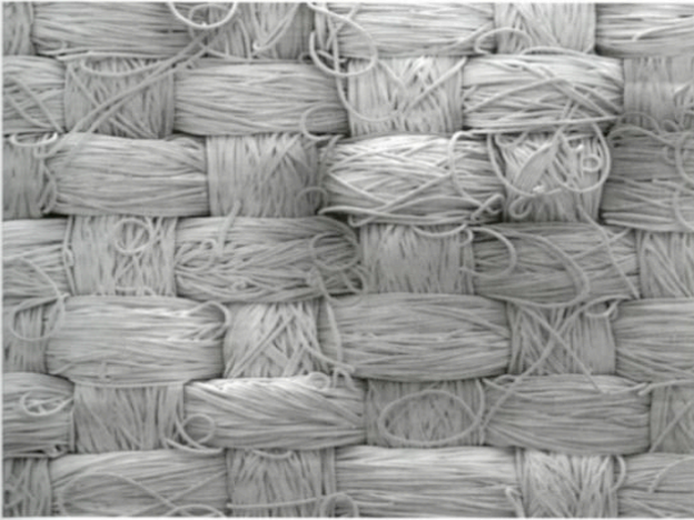
Close-up of CORDURA® fabric

quality workwear are using CORDURA® fabrics for reinforcing areas subject to the most strain and rigour: knees, pockets, hems, trouser seats, elbows and shoulders. It is even being used by some to add value to safety footwear, gloves, vests and tool belts.