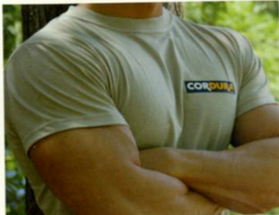
CORDURA® Baselayer knit fabrics offer 'No Melt No Drip' performance for combat soldiers in environments where flash fire explosions are a regular threat

Innovation must offer value if it is to succeed in today's global textile market - and fibre manufacturer INVISTA believes its CORDURA® brand fabrics may be the answer for the workwear and military apparel markets